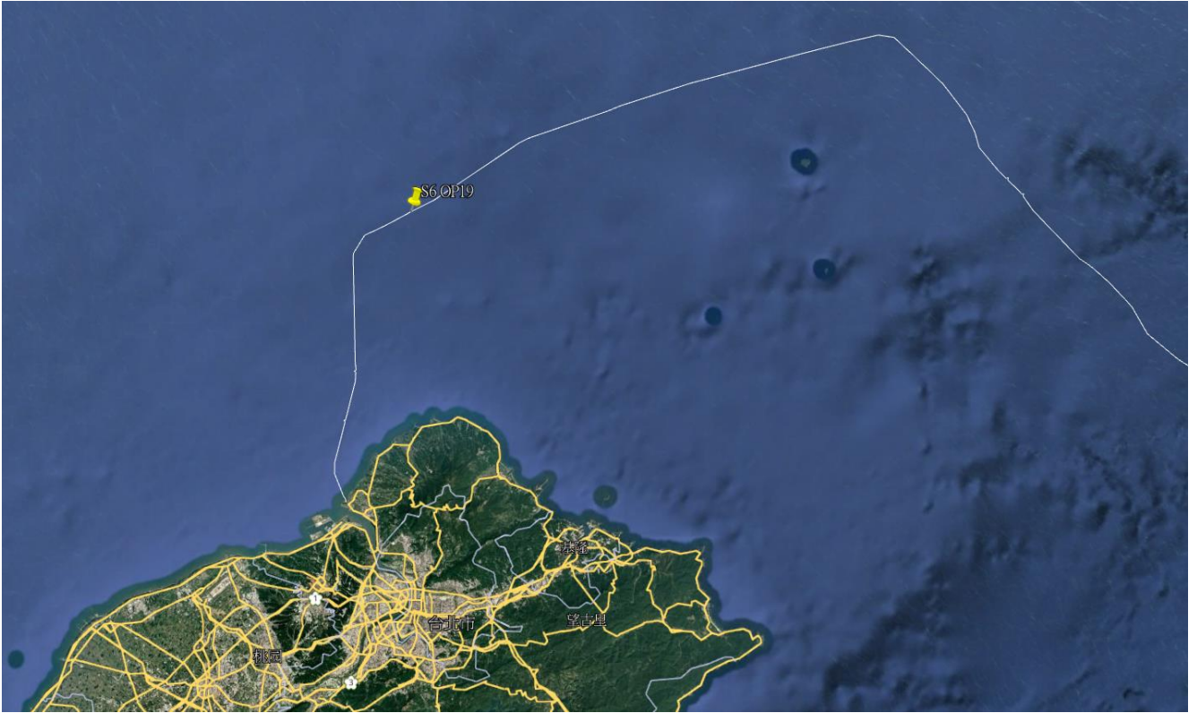
圖一：APCN2 S6 海纜故障位置圖

一、故障位置北緯 25 度 34.032 分；東經 121 度 30.190 分，距淡水外海約 55 公里，水深 115 公尺。